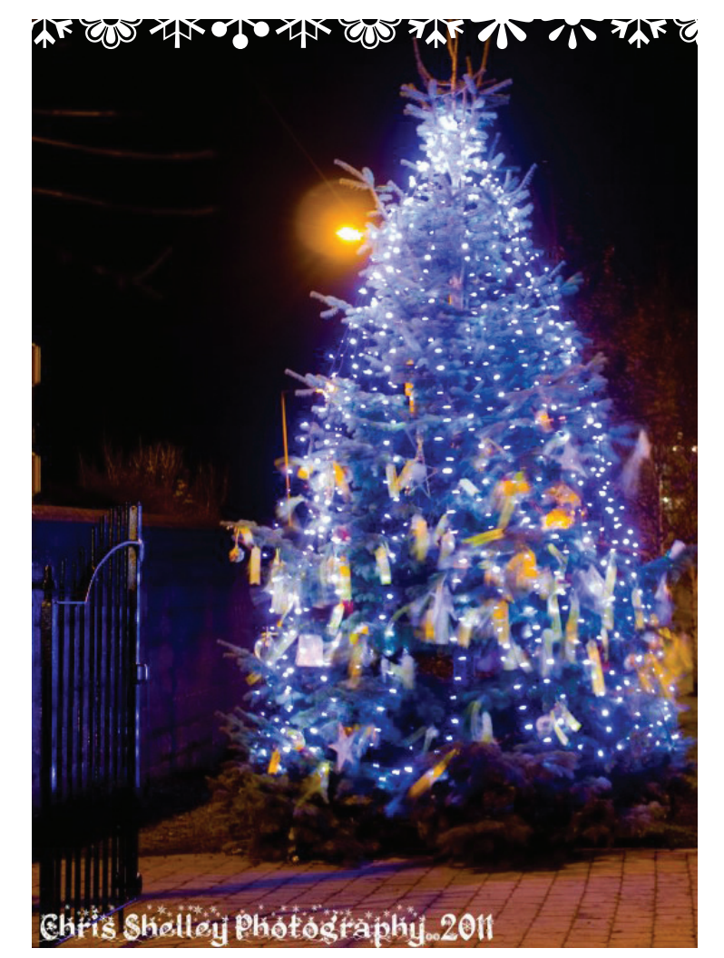
Christmas Tree 2011 - courtesy of Chris Shelley