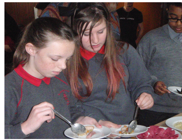
A taste of the past - You can see the enjoyment in their faces.