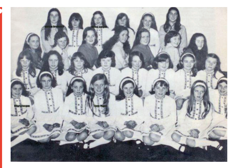
Rising Stars - The Rising Stars will shine again