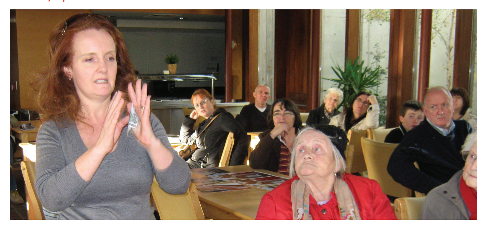
Discussing the street where they live

Check out the exciting community website: eastwallforall.ie