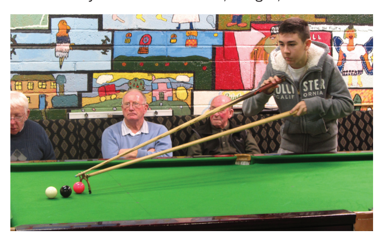
Intergenerational Snooker - It's a serious business.

Community events – all seasons, all ages, all welcome